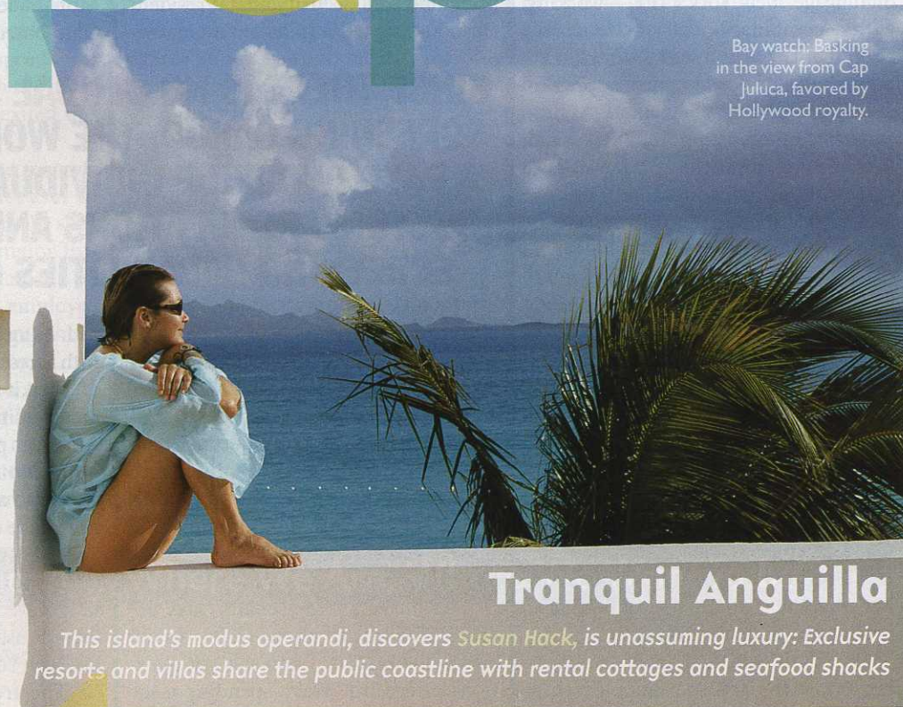
Bay watch: Basking in the view from Cap Juluca, favored by Hollywood royalty.

Two decades after apartheid's end, Cape Town is a city reborn, with new restaurants and hotels—and a new sense of pride.